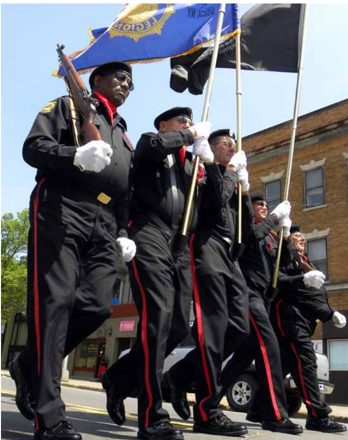
Utica Post 229 Color Guard performs in Memorial Day Parade.

Since its founding in Paris in 1919, The American Legion has been an advocate for America's veterans, a friend of the U.S. military, a sponsor of community-based programs for young people and a spokesman for patriotic values.