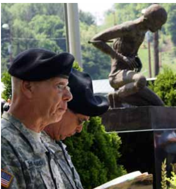
"Never forget." Chaplain at POW/MIA Monument.