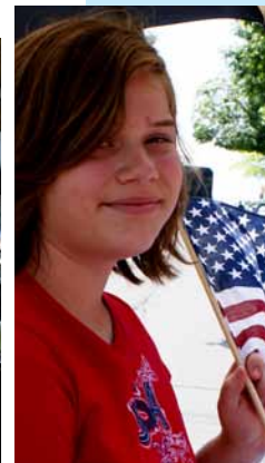
Auxiliary Unit 229 and its Junior Auxiliary.