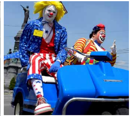
Shriners’ Ziyara Zanies