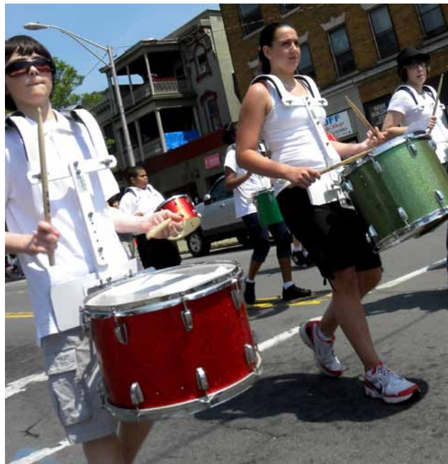
Proctor High School Marching Band.