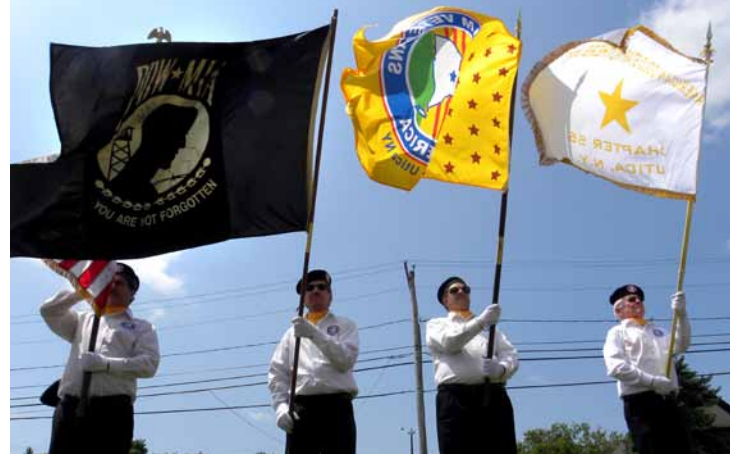
The Vietnam Veterans of America Color Guard showed their stuff at all six monuments.