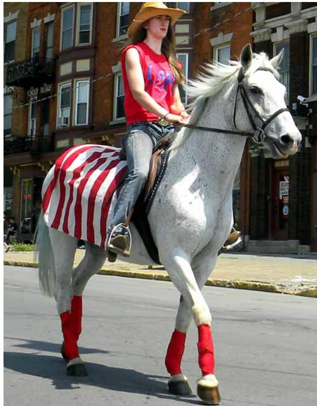
Children of the American Revolution.