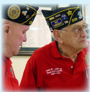
The Red Shirts came. P. 4.

POST MEETINGS ARE FIRST THURSDAY OF THE MONTH AT 7:30 P.M. (OPTIONAL DINNER AT 6:15)