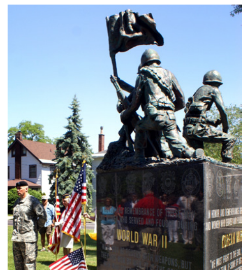
Veterans Day observance includes wreath-laying and prayers at three sites on the Parkway: Vietnam Veterans Memorial, POW-MIA Monument and World War I/World War II/Korean War Monument.