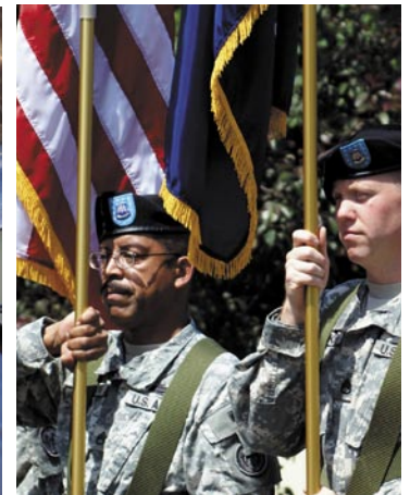
A few of the parade participants from last year. This year’s parade steps off at 2 p.m. May 30 on Genesee Street.