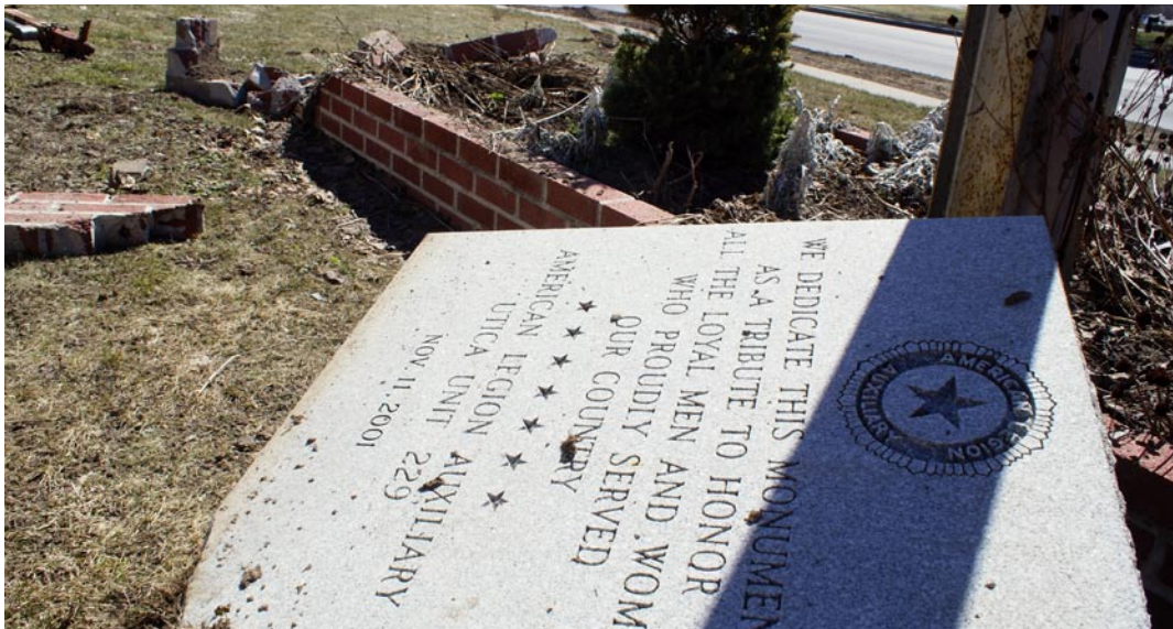
A motor vehicle accident in March resulted in a vehicle careening across the lawn and smashing into the brick wall and monument in front of the post home. Officers are working with the insurance company to have the damages repaired.